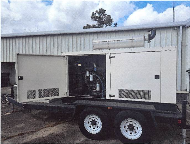
Unit Post Inspection